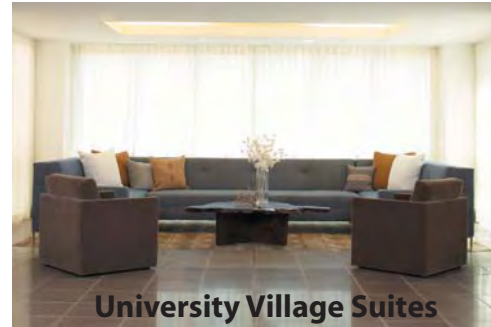
University Village Suites